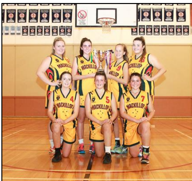
MacKThom Cup Girls Basketball