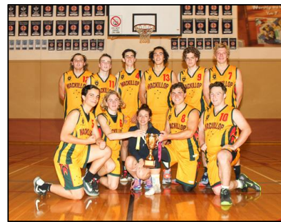
MacKThom Cup Boys Basketball