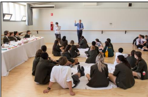
Global Reality Luncheon